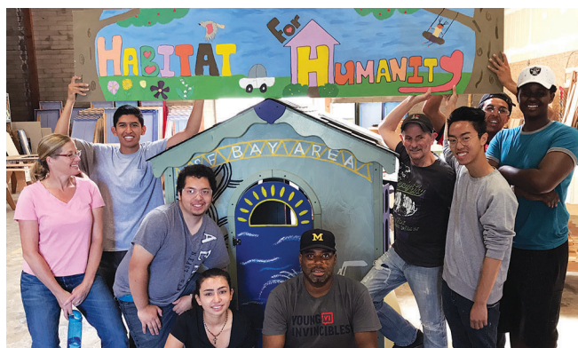
Summertime fun at Habitat for Humanity